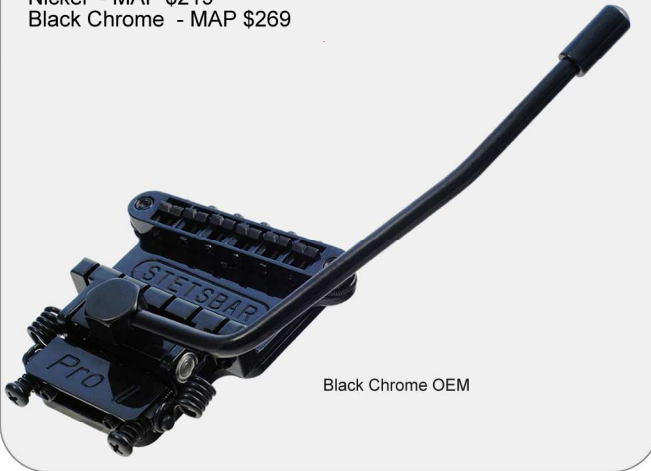
Black Chrome OEM