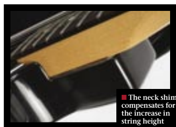
■ The neck shim compensates for the increase in string height

The Stetsbar vibrato works roughly along a similar principle to a Fender Stratocaster vibrato, whereby the mechanism 'floats' by balancing between the pull of the Stetsbar's springs and the opposing force of the guitar's string tension. Like Fender's