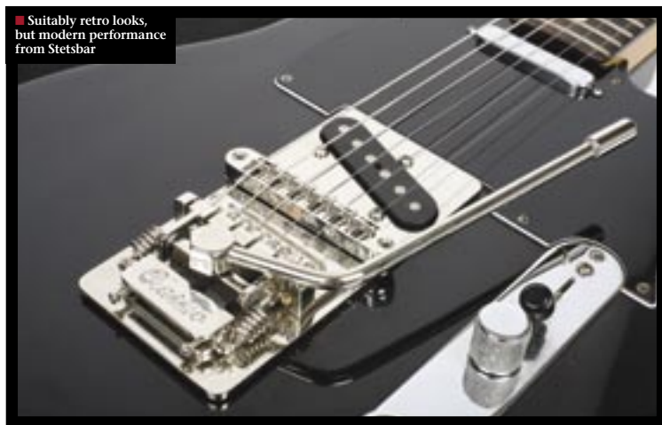
■ Suitably retro looks, but modern performance from Stetsbar